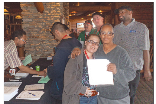
Workers voting on their brand new contract.

A tentative agreement has been reached. The agreement includes a substantial improvement on language and the largest increases in the bonus (double the amount). The workers on the negotiating committee are excited about strongly recommending a “Yes” vote.