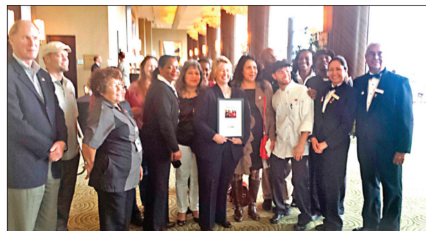
Members in Houston present Mayor Annise Parker a Thank You plaque for her support in improving the lives of hospitality workers.

As part of the Union's national campaign to get airlines to support the $10.10 minimum wage for airline catering workers, Dallas Sky Chefs workers went to American Airlines demanding a living wage for workers.